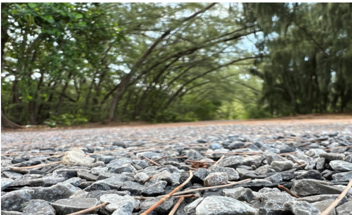
Completion of Virginia Key Basin Trail , providing an 8,000 linear feet recreational trail of crushed granite with structural grid reinforcement around our beautiful Biscayne Bay, creating uninterrupted access to the full U-Shape trail. The trail links to the historic Miami Marine Stadium. Project was both started and completed in 2024.

CAPITAL PLANNING AND MANAGEMENT - Since implementing the new invoice and purchase order process through the e-Builder platform in April 2023, OCI has processed over 569 invoices totaling approximately $33.2 million, and 183 purchase order requests valued at $18.8 million. OCI is actively working to increase user adoption of e-Builder and plans to finalize the new Contract Compliance process by the end of FY 2024.