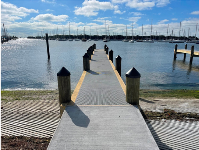
Completion of Kenneth Myers Park (Seminole Boat Ramp) , including 110 linear feet seawall, upgraded sidewalk, a boat ramp with three docking platforms, a floating dock and parking lot resurfacing.

OCI, in collaboration with the community, celebrated the completion and launch of numerous construction projects throughout this fiscal year: