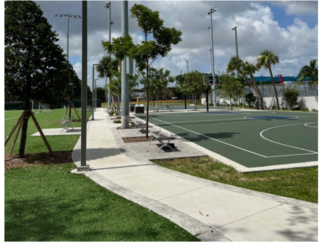
Completion of the Shenandoah Park Playground and a multipurpose field project to enhance the surrounding area of the newly completed aquatics center from last year.